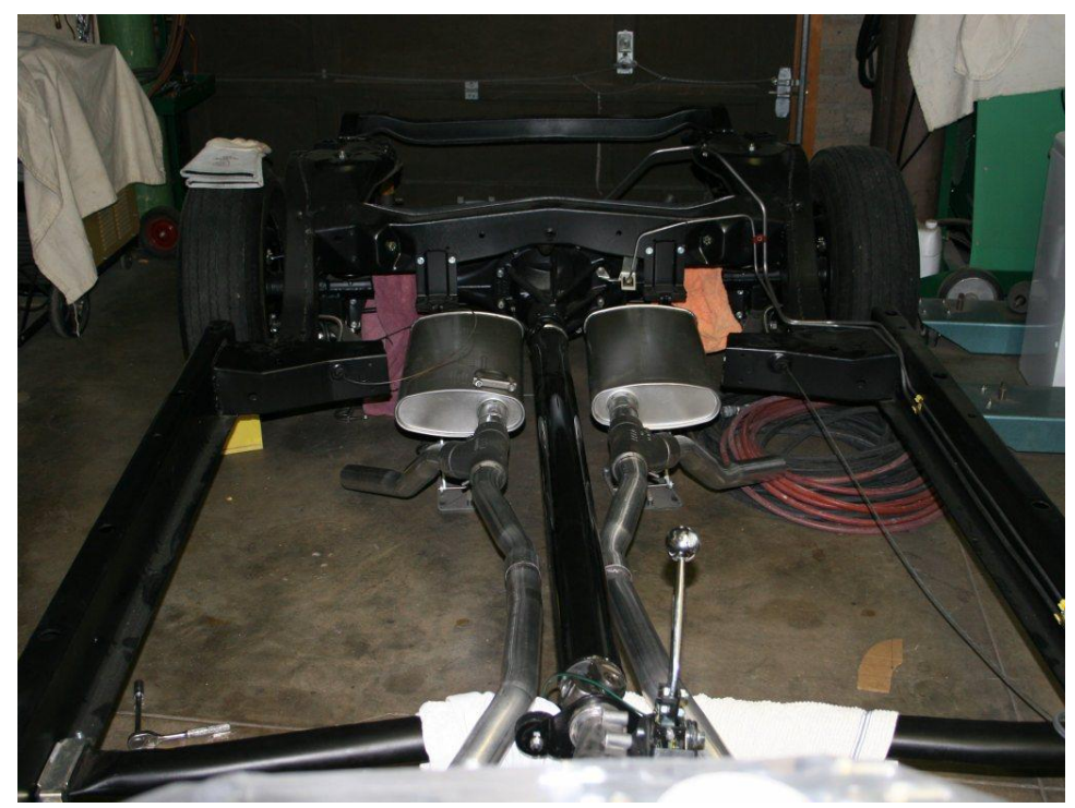
Exhaust with cutouts near mufflers.